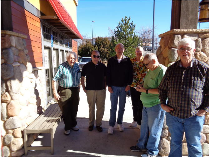
A Monday Lunch Bunch gathering at Famous Dave's BBQ.