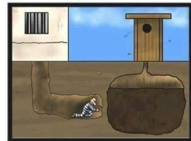
It Can Always Be Worse.