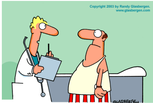
"What fits your busy schedule better, exercising one hour a day or being dead 24 hours a day?"