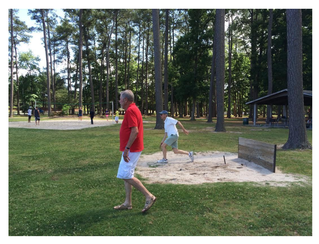
Horseshoes in the Park.