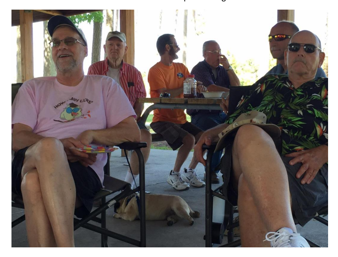
Some of the summer fun at a park in Virginia Beach.