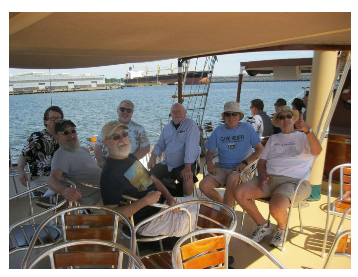
Boating on the American Rover.