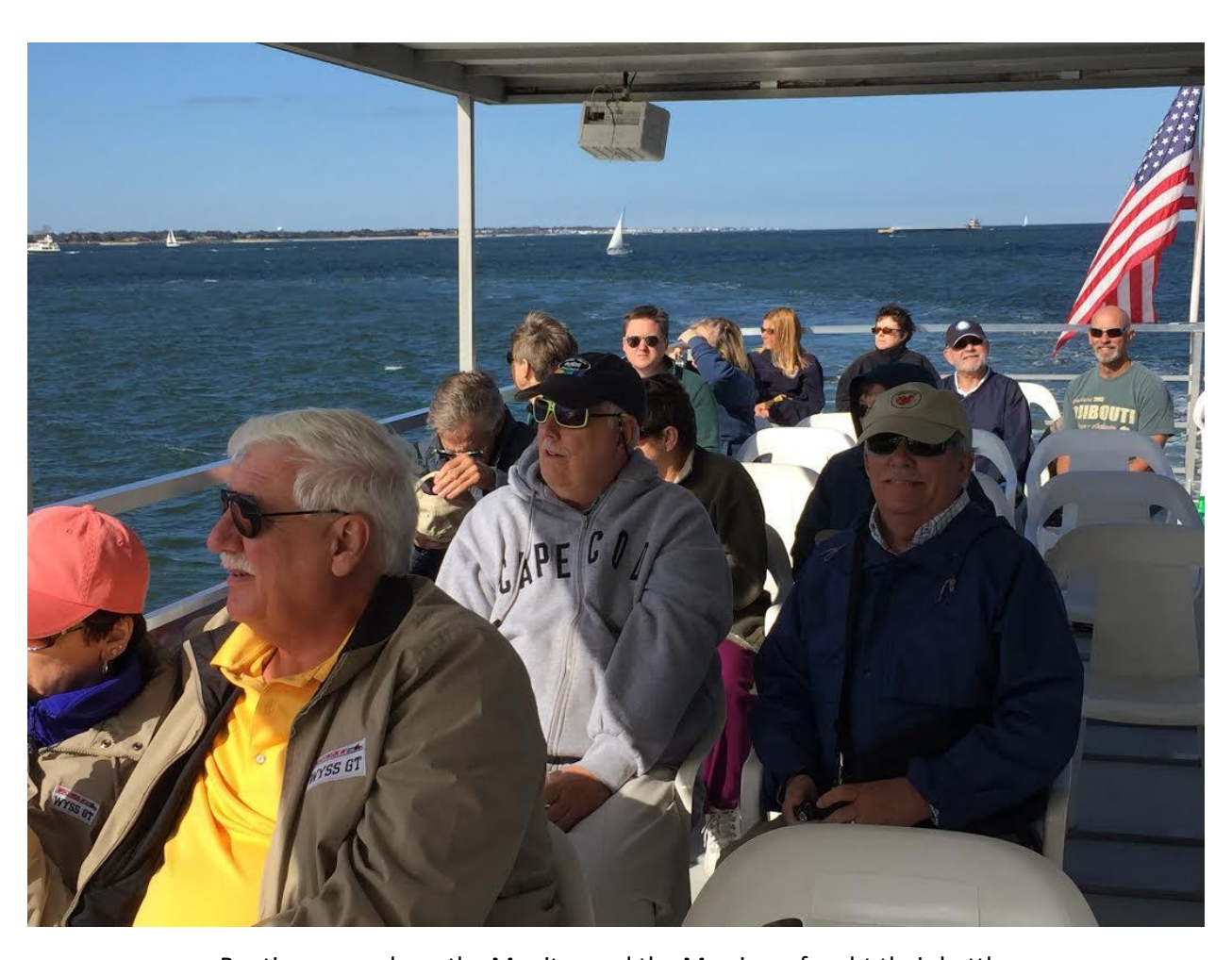
Boating near where the Monitor and the Merrimac fought their battle.